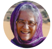
Dorcas Master Project, Canada

If you are fluent in French, there are many opportunities to minister to widows in these three Dorcas projects. You may have an admin or finance background, experienced in micro-loans, discipleship, or trauma counselling. Contact SIM Canada today!